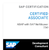
SAP Certified Development Associate - ABAP