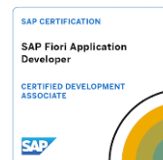
SAP Certified Development Associate - SAP Fiori Application Developer 2