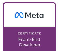
Meta Front-End Developer Certificate