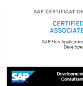
SAP Certified Development Associate - SAP Fiori Application Developer 1